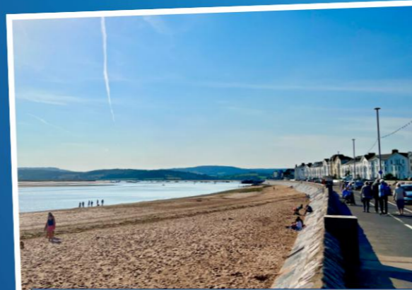
Cracking down on South West Water.

You told us how important it is and we agree. Profit and bonuses before health and nature is NOT acceptable. Conservatives, supporting our MP Simon Jupp, will crack down on SWW. Our town, our beaches and our seas all deserve better