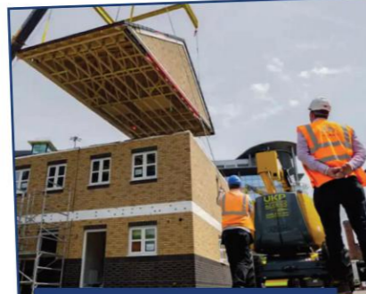
East Devon Conservatives will stand up for local residents.

We will work to ensure that there are sufficient affordable homes that our community requires, we will also explore building modular homes. Housing will be built in the right places and in the right way.