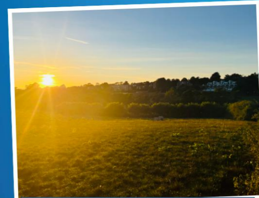
Getting the right local plan for Littleham.

Too many houses in the wrong places will irreversibly change the character of our area, and put pressure on services and infrastructure already in need of improvement. We Conservatives will ensure Exmouth Littleham, will be protected from over development.