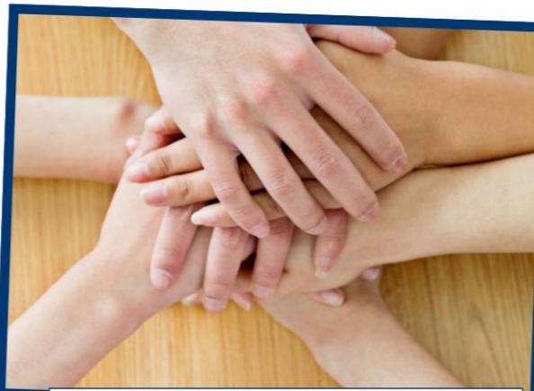
Supporting you during challenging times.

The Conservatives were against this rise and will reduce the price of parking in coastal car parks. This is what residents and business tells us they want, enticing people back into our town centre and to our seafront, supporting the local Exmouth economy.