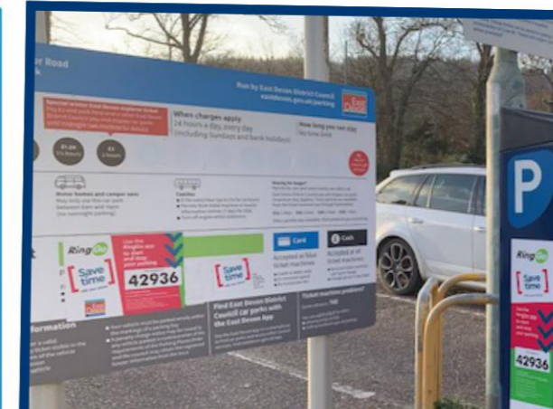
Reducing Higher Car Parking Charges.

Raising the price of our coastal car parks without any public consultation was a total scandal.